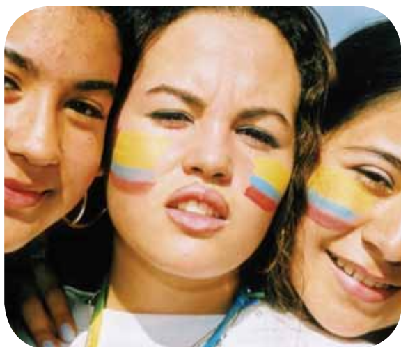
Naz Project London: Mobilising Latin American communities for sexual health

Project participant from a membership organisation