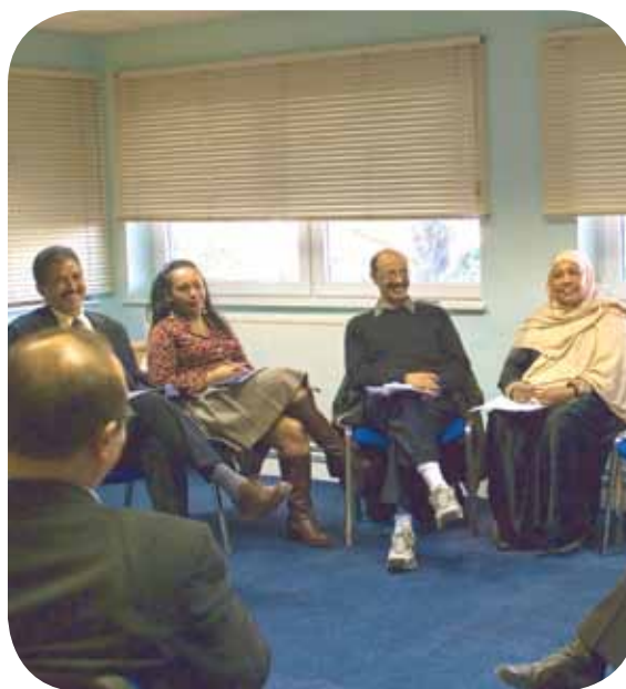
Workshop using open space methodology for MRCF member organisations

Participants from each organisation were expected to attend four workshops. At the start of the process, we agreed to design each workshop in detail as our understanding of the organisations' areas of interests developed. However, the workshops would focus on four key elements – an introduction to power, a focus on problem analysis, developing a strategy and sharing learning.