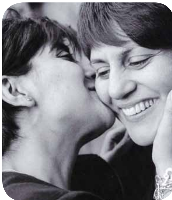
Naz Project London: celebrating ten years of services for lesbian, bisexual and questioning women.

Most importantly, it recognises that an analysis of power can provide the link between understanding the causes of social problems and taking action to achieve long-term social change. As competition for funding becomes tougher, and spaces for exerting influence become more crowded, it is essential that organisations, and the groups that they are working with, are able to address the issue of power and achieve change in the interests of achieving social justice.