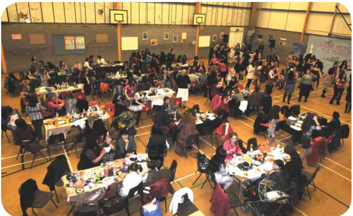
Shpresa Programme: Launch of the campaign 'From Agression to Unity'

Participants were encouraged to track their own learning and development through self-documentation. This could be in written, video or audio form. The purpose of this would be to help participants to set their own goals and criteria for measuring success.