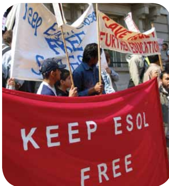
ESCOL funding rally in Trafalgar Square