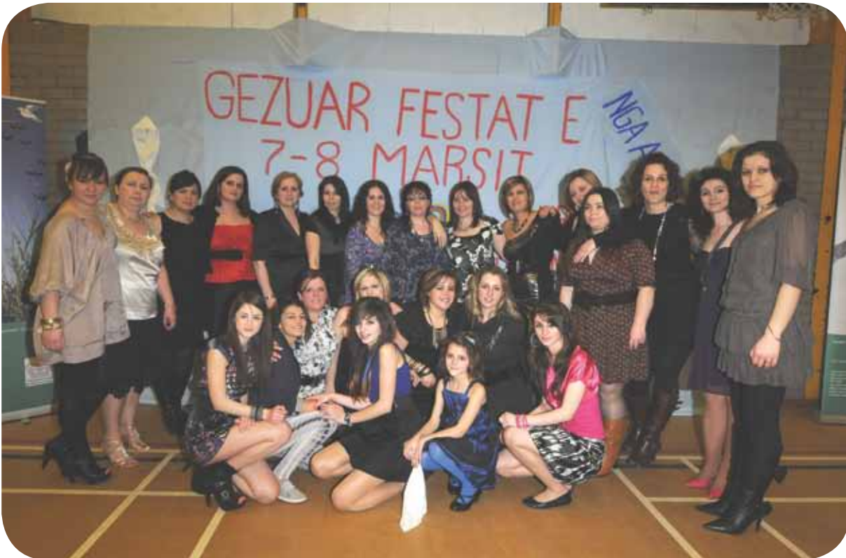
Shpresa Programme: Launch of the campaign 'From Agression to Unity'

For us, like the organisations we worked with, the distinctions stated above were not always as clear-cut as they might seem, and we believed that power could be all of these things.