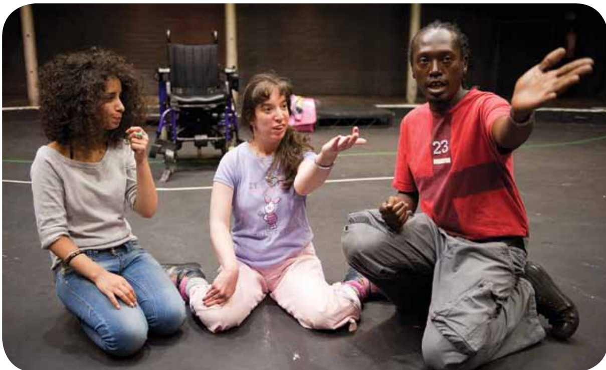
Rehearsals for Spare Tyre's 2009 production Feeble Minds.

We also hoped that the organisations would gain the confidence to combine these frameworks to deepen their analysis – as the Power Matrix referred to above encouraged them to do. We did not see this happen to a great extent during the course of this project, but we do believe this should be encouraged in the future.